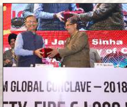
IISSM Annual Global Conclave 2018 at New Delhi.