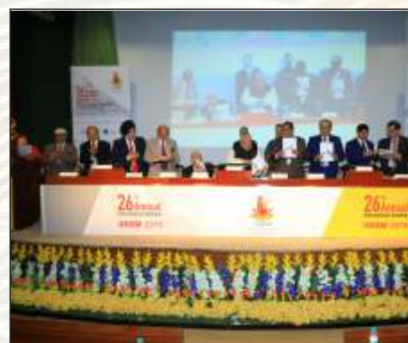
IISSM Annual Global Conclave 2016 at New Delhi.