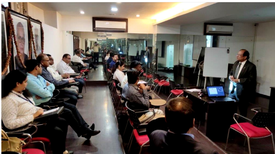
GROUP PHOTO OF CSP

Overall the course was very well appreciated.